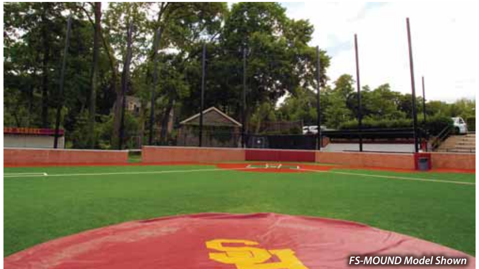
FS-MOUND Model Shown