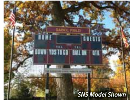
SNS Model Shown