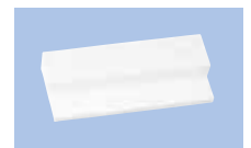
Pro Step Down Pitcher's Rubber