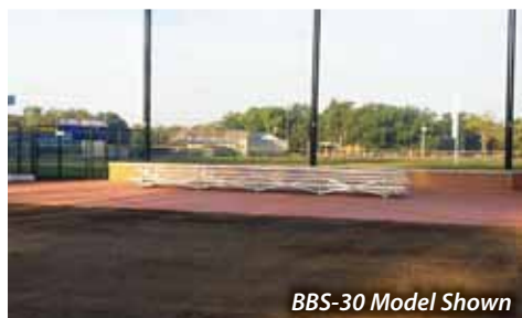
BBS-30 Model Shown