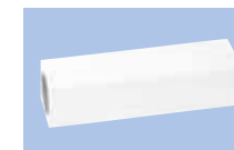
Pro Model 4-Way Pitcher's Rubber