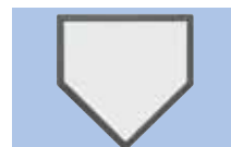
Home Plate - Cherry Hardwood Bottom