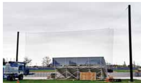
BBS-30-CD_12 model shown during installation.