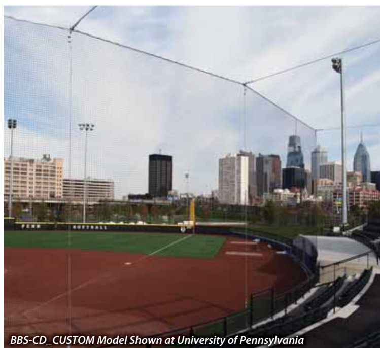
BBS-CD_CUSTOM Model Shown at University of Pennsylvania