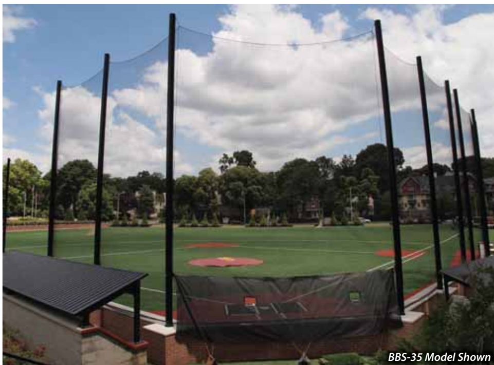
BBS-35 Model Shown