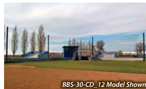
BBS-30-CD_12 Model Shown