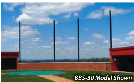
BBS-30 Model Shown