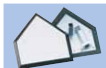
Home Plate w/ Anchor