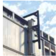
Custom mounting bracket anchors netting on SNS-MBS model.

visit AAEsports.com or call for pricing visit AAEsports.com or call for pricing