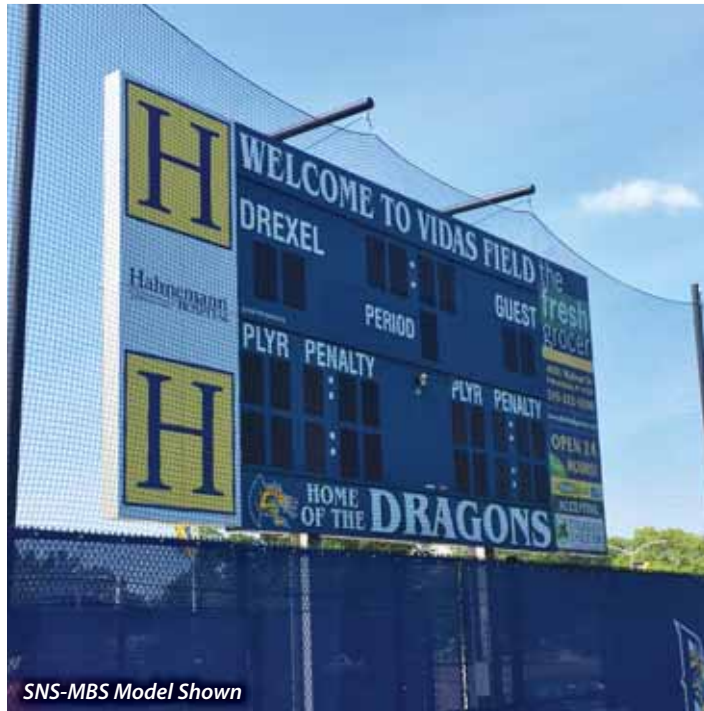
SNS-MBS Model Shown