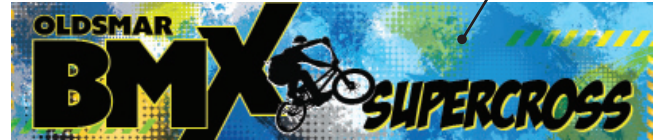
Custom printed full vinyl wrap for DONKEY Banner